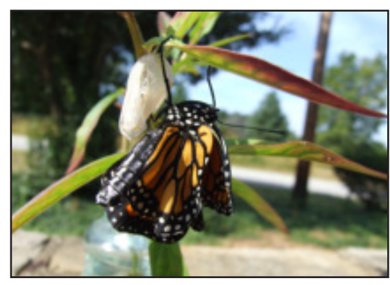
Newly Emerged Monarch

Adult butterflies feed on flower nectar and are not as specific about nectar plants as they are host plants. Butterflies are attracted to solid masses of color, flower fragrance, and flower shape.